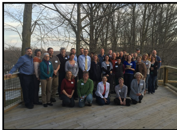
WMCN Partners at the 2016 Annual Meeting

The Habitat and Restoration Subcommittee had a very productive year in 2016 and made significant progress on the intermediate outcomes listed in the strategic plan. Priority sites and species were identified both in accordance to grantors desires and the needs of the region. Management activities included hand pulling and chemical treatment of these invasives, using many different treatment techniques. All treatments will be monitored in 2017 and management goals and techniques will be adjusted as needed based on monitoring results. One priority for 2017 is formalizing a response plan to respond to new infestations and species in the region. Two new high priority species were identified in West Michigan in 2016; European frog-bit and yellow floating heart. Both of these species are on the State of Michigan Watch List.